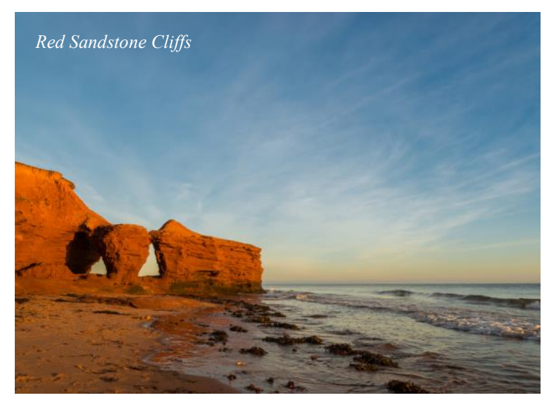
Day 3: Sunday, July 8, 2018 • Southeast Coast - Charlottetown

We enjoy a leisurely Sunday morning including a visit to the Downtown Farmer's Market (open Sunday 11AM-4PM in 2017) before taking a drive East down the coast. We stop at Point Prim lighthouse, the first constructed on the island and then continue along the scenic coast to Wood Island Lighthouse. Our final stop is at Rossignol Estates Winery, where we enjoy a tasting of their award-winning wines, most notably the Wild Blueberry wine. We return to Charlottetown for our final overnight and enjoy a lobster dinner for our farewell meal. B , D