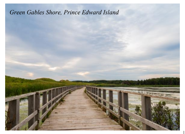
Day 1: Friday, July 6, 2018 • Depart - Charlottetown We depart today for the "Land of Anne", Prince Edward Island. We arrive in Charlottetown by late afternoon, in time to check into our hotel and freshen up before our welcome dinner and the rest of the evening will be at our leisure. D